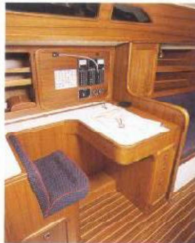
Example of optional teak interior